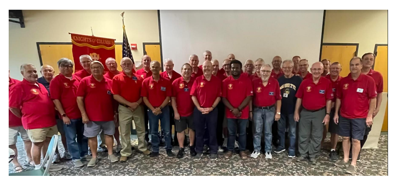
Assembly #2751 members gather for August meeting at Holy Apostles.