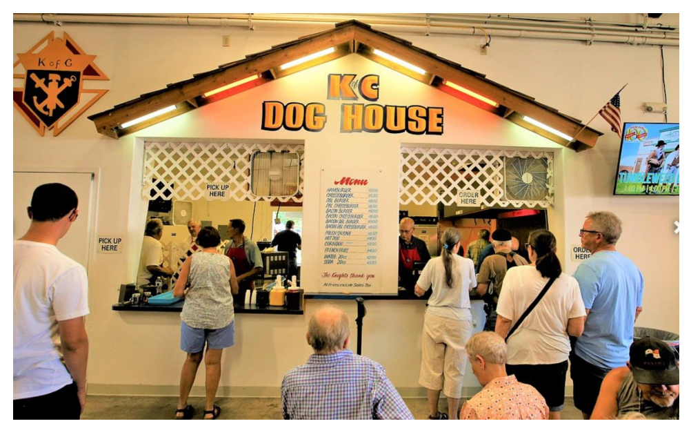
Customers line up at the Knights of Columbus Dog House