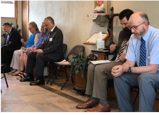
Some of the members of the Idaho Falls Council and their wives pray an intentional rosary for all council members.