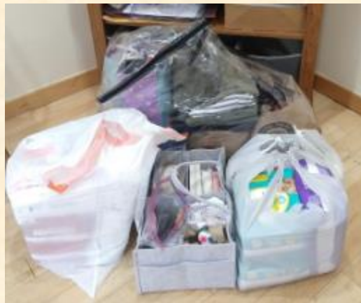
One of a few drop-offs to The Advocates women's shelter in the Wood River Valley.