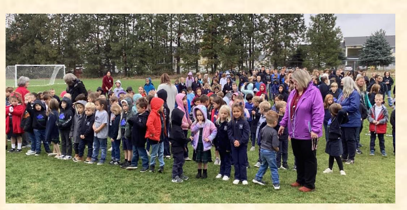
Students forming up on the playground