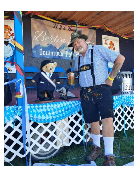
Page 14 of 17