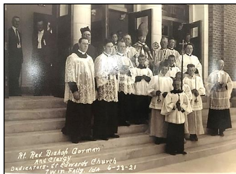
Dedication of St. Edwards Church in Twin Falls on 6/28/1921 by Bishop Gorman, and clergy.