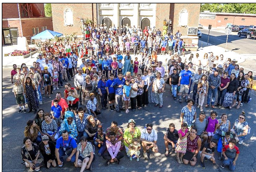
At Left- Parishioners form in the number 100 on the street in front of St. Edwards