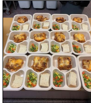
Once prepared, these meals are vacuum sealed, then delivered by volunteers to homebound seniors.