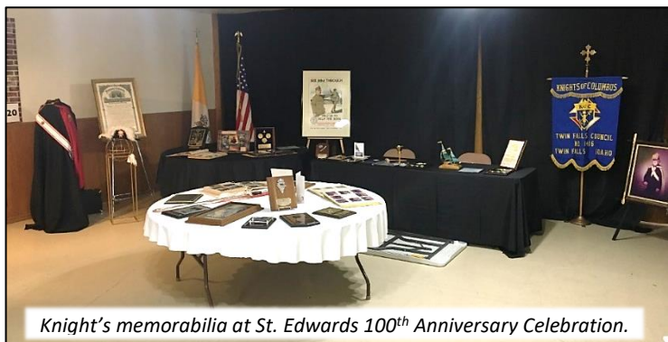
Knight's memorabilia at St. Edwards 100 th Anniversary Celebration.