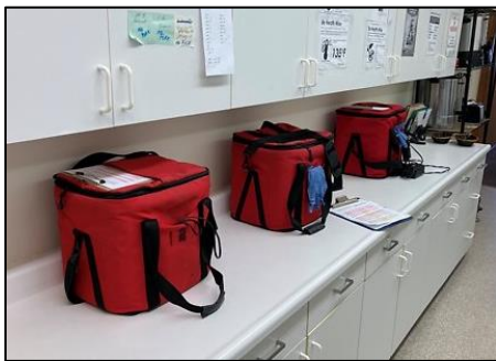
These heat packs keep the meals warm until they are delivered.