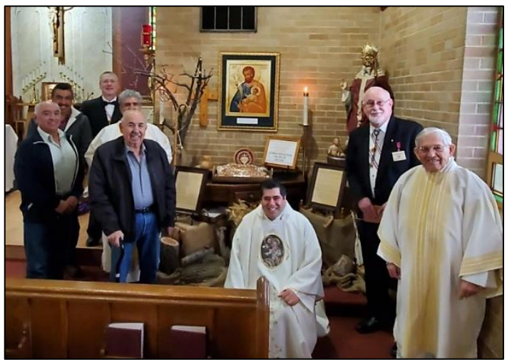
ST. JOSEPH, PRAY FOR US!