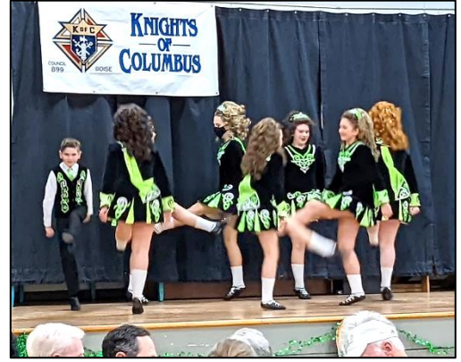
Killarney Irish Dancers dancing at St Patrick's dinner.