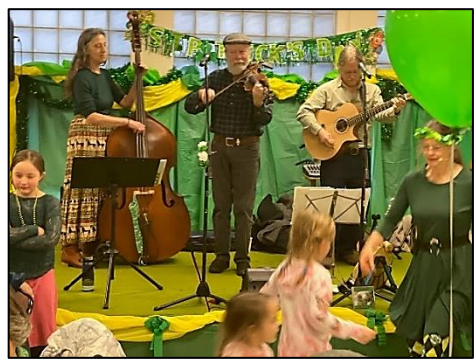
Featured was the Irish folk group, with one member leading some young people in a folk dance.