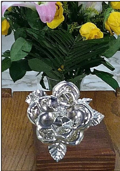
The Silver Rose.