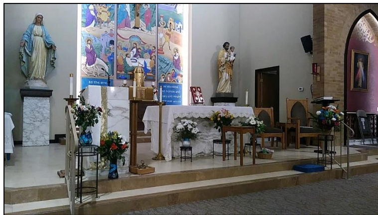
St. Anthony's Chapel prior to the Silver Rose Program.