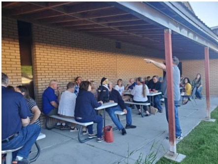
Submitted by Mat Metcalf