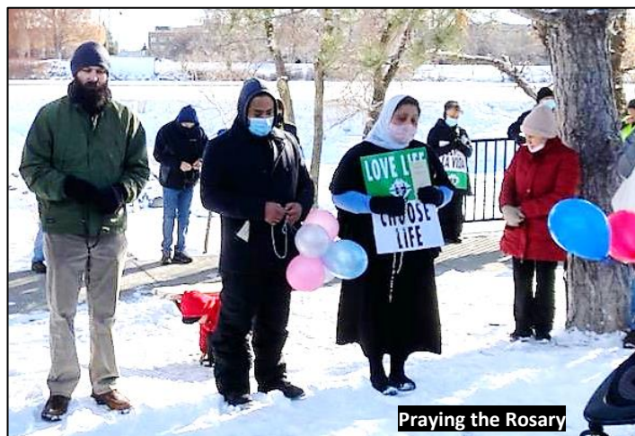
Praying the Rosary