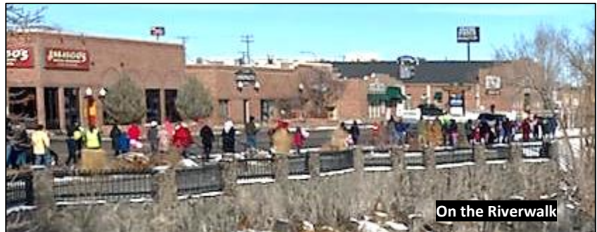
On the Riverwalk