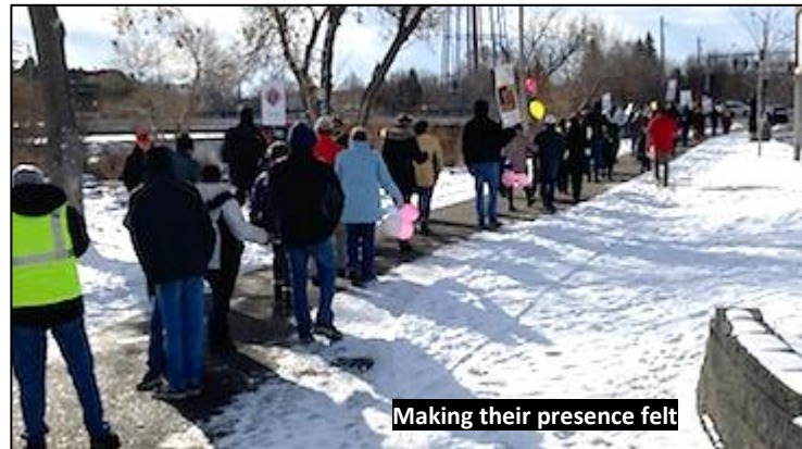
Making their presence felt

The marchers, 65 strong, from several local churches and cities as far north as St. Anthony and as far south as Pocatello, were led Knights bearing a huge Knights of Columbus pro-life banner. The marchers carried pro-life placards and balloons. We sang the Divine Mercy Chaplet while traversing from one side of the river to the war memorial on the other, turned around, and sang the Chaplet on the return route. Each decade was offered for the end to abortion, the elderly. And the desperate poor, but mostly for the unborn. We prayed a bilingual rosary for all three causes.