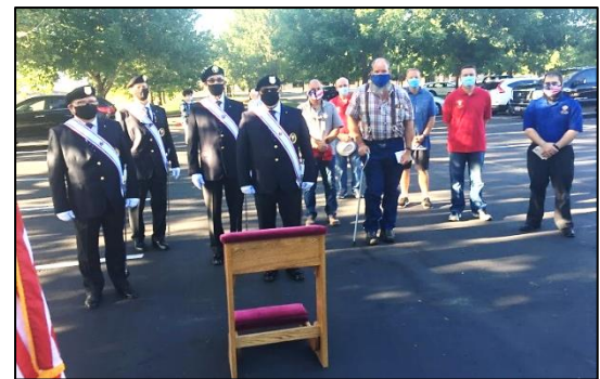
Ceremony team with new members in a group shot.

Everyone is excited about the adventure and looking forward to a more welcoming Hall to greet KC's, family and friends.