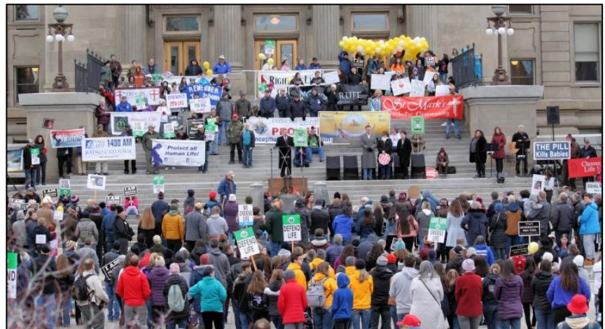
Group picture on the Capitol steps